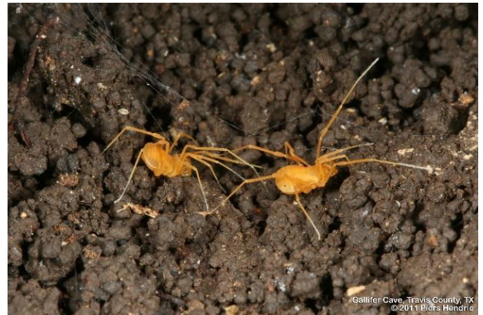
Gallifer Cave, Travis County, TX

The bone cave harvestman (“harvestman”) is a “tiny, pale, orange, eyeless . . . spider-like species that spends its entire life underground” and is endemic only to Travis County and Williamson County in Texas. 369 The U.S. Fish and Wildlife Service (FWS) listed the harvestman as endangered under the Endangered Species Act (ESA) 370 in 1993 because of its “limited population and fragile nature.” 371