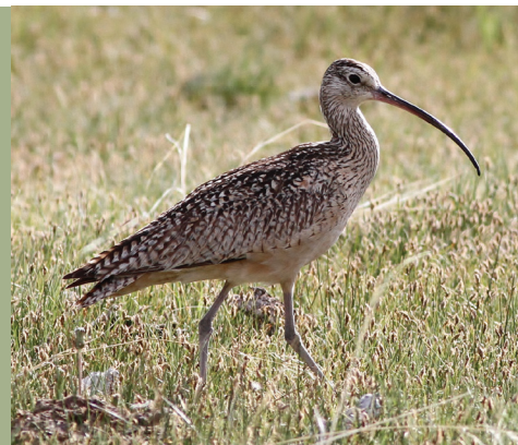
LONG-BILLED CURLEW - ALEX LAMOREAUX

Almost half of the native landbirds (418 species) in North America rely on habitats in at least two of its three countries—United States, Canada, and Mexico. The Chihuahuan Desert supports 90% of migratory species breeding in the western Great Plains, including 27 species recognized as high priorities for conservation, such as Baird's Sparrow and Chestnut-collared Longspur, which winter nowhere else.