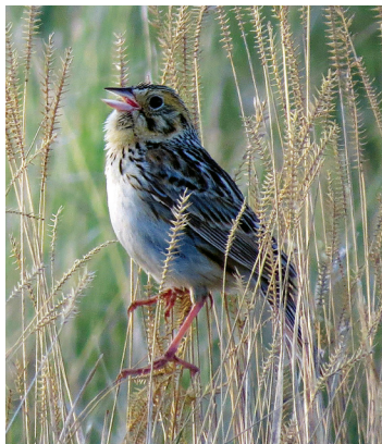
BAIRD'S SPARROW - SASHA ROBINSON