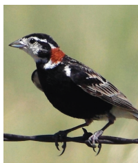
CHESTNUT-COLLARED LONGSPUR - LEE FARRELL

The states of Arizona, Colorado, Montana, and New Mexico have contributed to developing a Sustainable Grazing Network to protect and restore grasslands on private and communal (ejido) lands in Mexico's Chihuahuan Desert. Bird Conservancy of the Rockies' Sustainable Grazing Network engages ranchers in grasslands conservation and management, working collaboratively to support their transition to more efficient and sustainable production practices, and enhancing habitat for birds. Since 2013, 15 ranches representing 250,000 acres have been enrolled in this network and another 300,000 acres of ranchlands has been identified as having a high potential for enrollment.