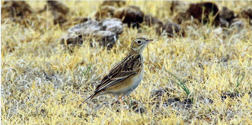
SPRAGUE'S PIPIT - JOSÉ HUGO MARTÍNEZ GUERRERO