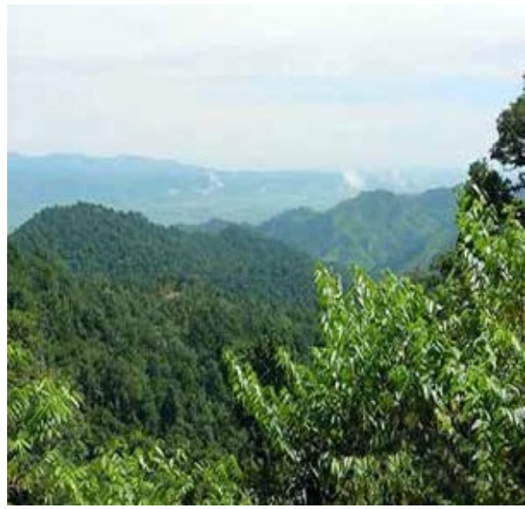
Sierra Caral