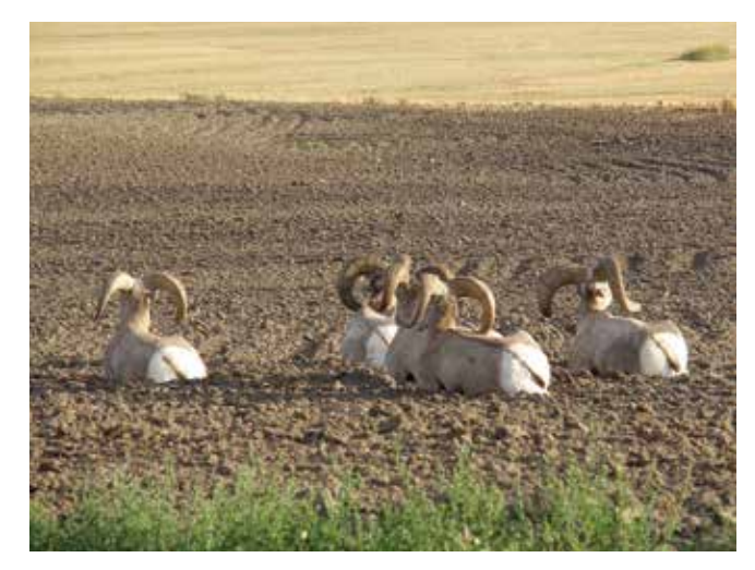
Big Horned Sheep in agricultural field

Priorities for the 2018 Farm Bill at the AFWA Business Meeting in March. These priorities will continue to guide the Association's advocacy work as Congress moves forward with debating the 2018 Farm Bill. Through the Association, state fish and wildlife agencies are also represented on multiple conservation and agriculture coalitions, many of which have developed policy recommendations that reflect and support the Association's priorities.