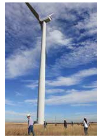
Wind-Wildlife Workshop participants practice a post-construction fatality survey for bats.

The Association was represented by Kansas Parks and Wildlife and the Oklahoma Department of Wildlife in a new forum hosted by the American Wind Wildlife Institute to exchange perspectives on approaches underlying our values related to conservation and wind energy siting, seek better understanding of opportunities and constraints related to wind energy and wildlife, and identify opportunities for potential collaboration.