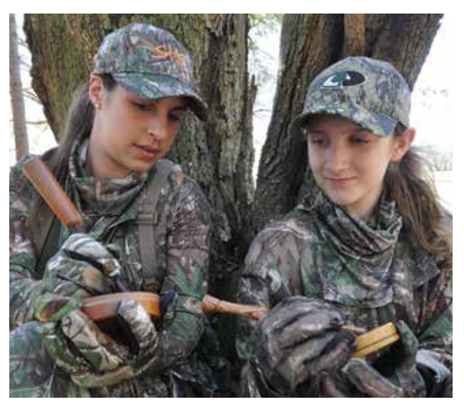
Learning to turkey hunt

In its fourth year, AFWA's Legal Strategy program has filed amicus briefs in support of state authority to manage wildlife, worked with AFWA's Executive and Legal Committees to clarify the relationship between State and Federal conservation and land management agencies, and responded to issues of national importance revolving around the central aim of furthering state-federal collaboration. The Legal Strategy has raised awareness of the North American Model of Wildlife Conservation and provided legal analysis and support for other key AFWA initiatives such as the Joint Federal/State Task Force on Federal Assistance and the Feral and Free-Ranging Cat Work Group.