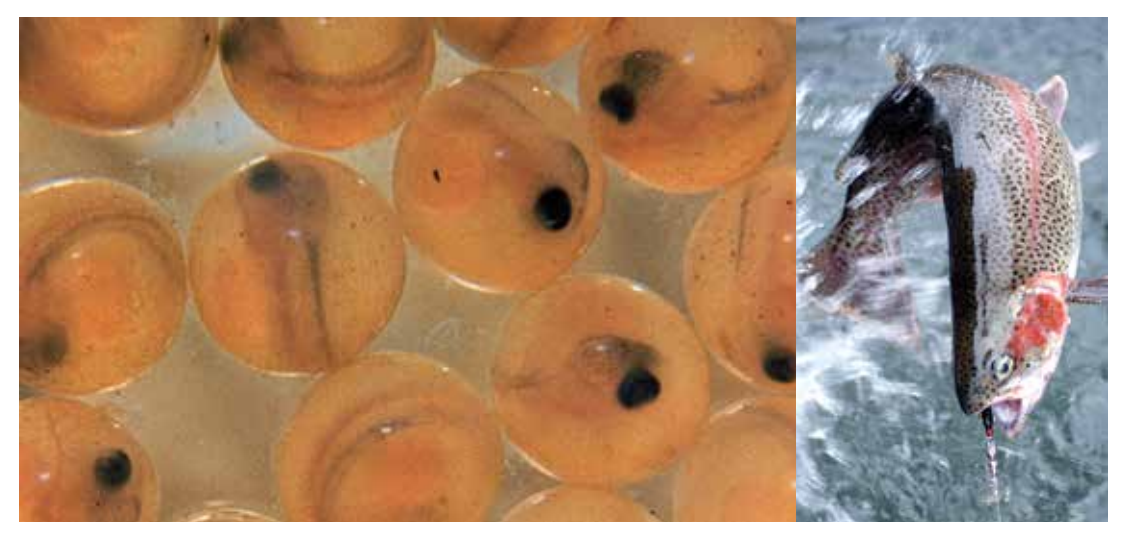
Altantic Salmon eggs

The Endangered Species Act (ESA) is a cornerstone piece of legislation that was enacted in 1973 and last amended in 1988, to facilitate the recovery of federally threatened and endangered species of fish, wildlife, and plants. The Association and our State agency members support this critically important statute but realized that statutory and regulatory improvements are needed to fully realize Congressional intent, capitalize on states member agencies' expertise and community relationships, and most importantly recover more species. The Association transitioned our "General Principles for Improving Implementation of the Endangered Species Act" into a technical guidance document that more fully expounds upon the various perspectives and desired improvements of the States and identifies areas where statutory and rule changes could enhance, improve, and likely expedite the recovery of federally listed species. This document may be used to guide any future legislation and discussions with federal agencies and Congress for improving the recovery of fish and wildlife species through an enhanced role of our State member agencies. Further, the Associated assisted several State Directors with preparations for hearings and briefings on how to improve recovery of our nations' fish and wildlife under the ESA.