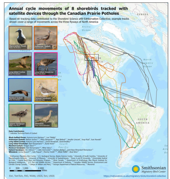
MAP 1: MIGRATION PATHWAYS OF 8 INDIVIDUALS OF 8 SHOREBIRD SPECIES CROSSING THE CANADIAN PRAIRIE POTHOLES REGION.

CLICK on any of the maps to view/ download full resolution version.