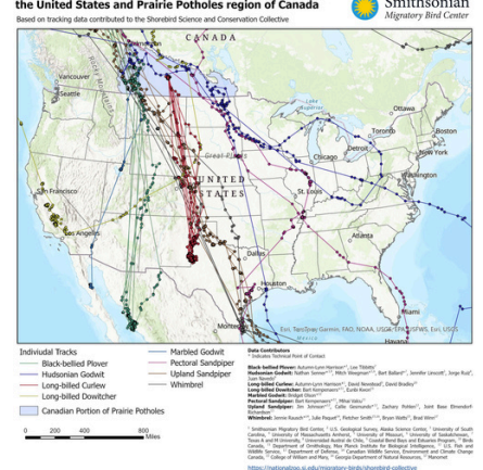
Map 4: Shorebird movements in both the United States and Canadian portion of the Prairie Potholes region