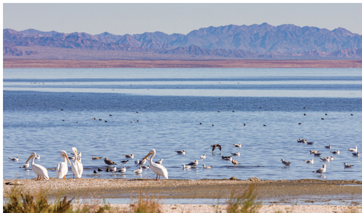
Partners are coming together to restore habitat for pintails and hundreds of migrating species. SALTON SEA, CALIFORNIA.