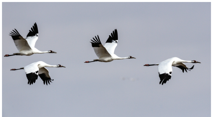
A quartet of whooping cranes flies over the Platte River.