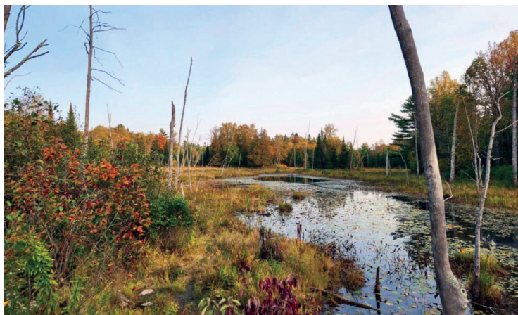
Conserving prime wetland habitat in eastern Canada for waterfowl and migratory birds in the Atlantic Flyway.