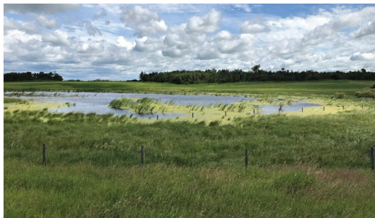
Conservation of wetland and grasslands provides nesting habitat in Canada.

Far to the south, pintails winter at California's Salton Sea, where shrinking waters threaten both birds and people. Thanks to the Salton Sea Conservancy, diverse partners are coming together with bold investments to restore habitat and renew hope for pintails and the communities that share their home.