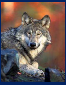
Gray Wolf

The health of wildlife is often an early indicator of disease and pollution that affect us all. State Wildlife Grants are helping Oregon coordinate responses to disease issues and outbreaks (e.g., chronic wasting disease, hair loss syndrome, Newcastle's disease, West Nile virus) and will enable better coordination with other state and federal agencies and provide information to the general public. This will allow us to identify and prevent problems before they threaten wildlife and affect humans.