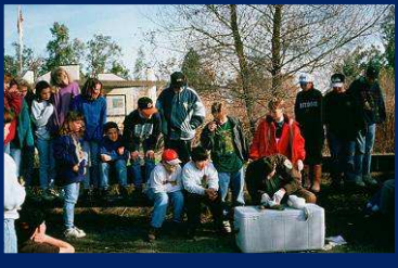
Disease Disorder Demonstration

In the five years since its inception, the State Wildlife Grants Program has played an important role in the conservation of Oregon's wildlife. The following are some of the projects funded through State Wildlife Grants: