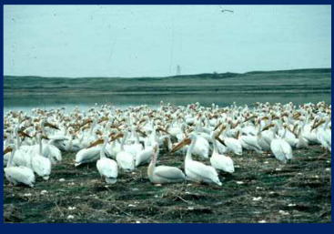
White Pelicans at Chase Lake

In the five years since its inception, the State Wildlife Grant Program has played an important role in the conservation of North Dakota's wildlife. The following are some projects funded through State Wildlife Grants: