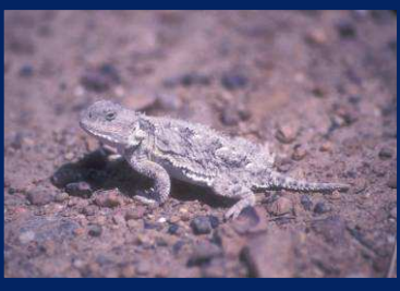
Short Horned Lizard

The white pelican's of Chase Lake are disappearing by the thousands and no one knows why. Over four days in May of 2004, the number of white pelican's at the lake dropped from 27,000 to 80, and thousands of eggs and chicks were left unattended and dying. In 2005, 18,000 adult pelicans returned to Chase Lake for nesting. Everything seemed to have returned to normal until July, when dead white pelican chicks began turning up—8,000 at last count—and the adults again took off. State Wildlife Grants are being used to help unravel this mystery, as well as to gather basic data on white pelican behavior. Since the health of wildlife is often an early indicator of disease and pollution that affect us all, understanding why the white pelicans are disappearing is important to us all.