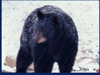
Black Bear

In the five years since its inception, the State Wildlife Grants Program has played an important role in the conservation of Kentucky's wildlife. The following are some of the projects funded through State Wildlife Grants: