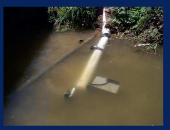
River Research

In the five years since its inception, the State Wildlife Grant Program has played an important role in the conservation of Illinois' wildlife. The following are some projects funded through State Wildlife Grants: