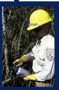
Invasive Plant Management, Photo Courtesy of USFWS

The Cache River watershed contains globally critical ecosystem including swamp, wetlands, and bottomland hardwood forest. A diverse group of public agencies and private conservation organizations have come together to try and conserve this area. State Wildlife Grants are helping coordinate recommendations on the restoration of the watershed's hydrology. By acting to protect the Cache River now, we can conserve the diverse array of wildlife that live there—including bobcats, river otter, and migratory birds—for future generations.