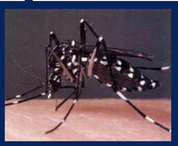
Asian Tiger Mosquito

Little is known about the grassland birds that live on the Piedmont and Coastal plains of Delaware. State Wildlife Grants are helping us learn more through a project that will assess the status and distribution of grassland birds. Information gathered through the survey will be used to establish conservation priorities and guide management with current and future conservation partners. Such knowledge allows us to make proactive decisions to conserve wildlife and the places they live before they become more rare and costly to protect.