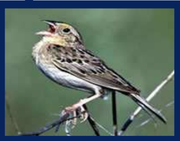
Grasshopper Sparrow

A forest habitat conservation plan is being developed in coordination with the Delaware Forest Service to identify ways to maintain a healthy economy and healthy forests through incentive-based programs. Landowners that manage forestland for wildlife diversity may receive property tax exemptions or reductions. Practices, policies and regulations related to forest management and conservation will be reviewed to ensure programs are coordinated and consistent for maximum benefit to wildlife and forest landowners. This proactive approach to conservation will ensure healthy forestland for future generations.