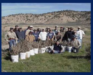
Outreach Project

In the five years since its inception, the State Wildlife Grant Program has played an important role in the conservation of Colorado's wildlife. The following are some projects funded through State Wildlife Grants: